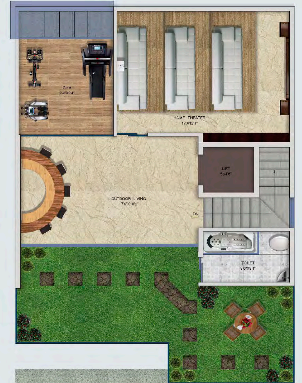
Third Floor : 1040 Sqft (House 700 Sqft & 340 Sqft of Terrace Garden)