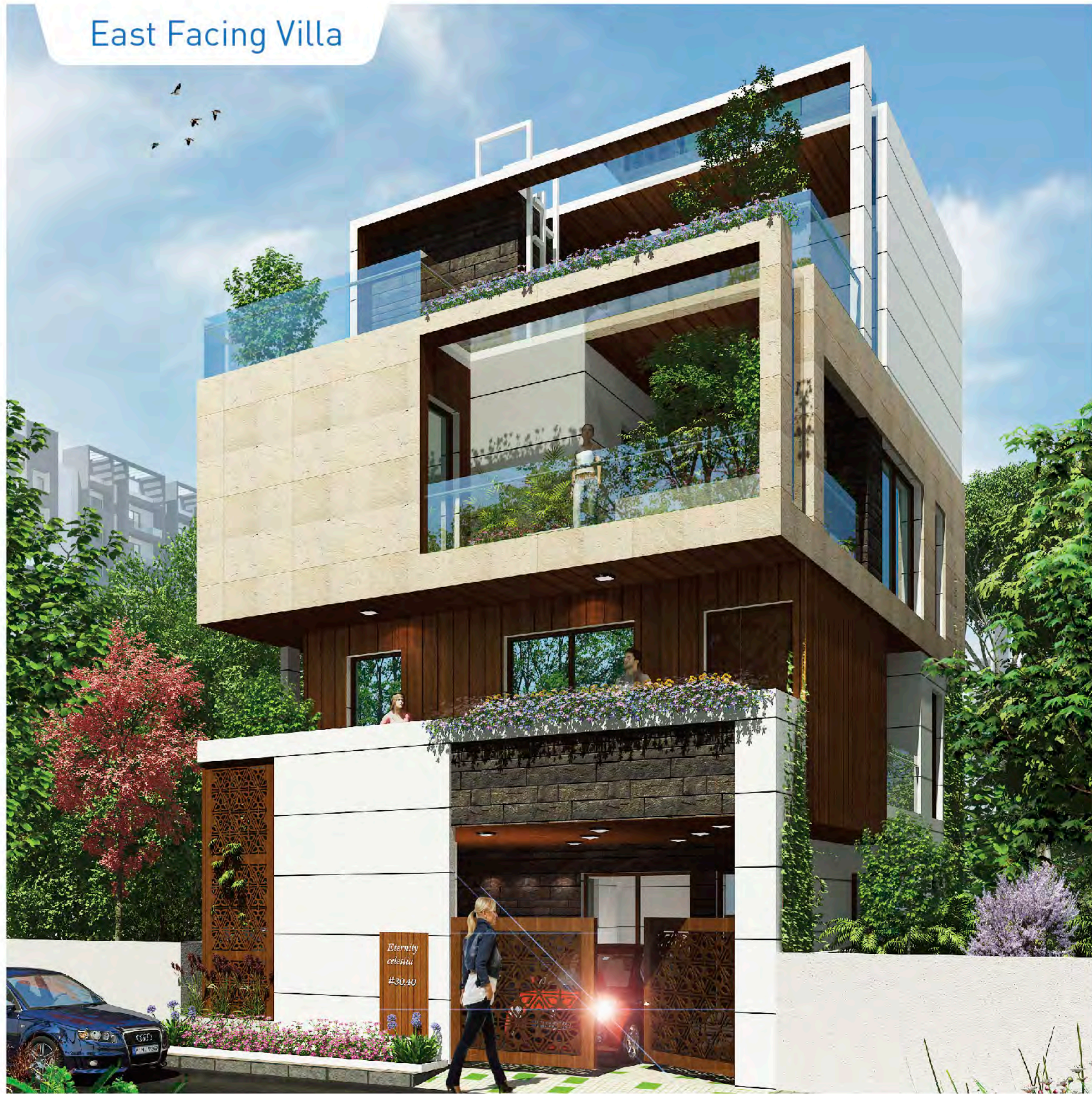
East Facing Villa