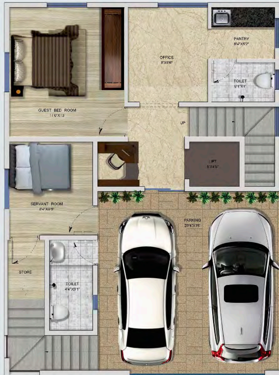
Ground Floor: 1045 Sqft (690 sqft – Personal Office, 2 Car Parking – 355 Sqft)