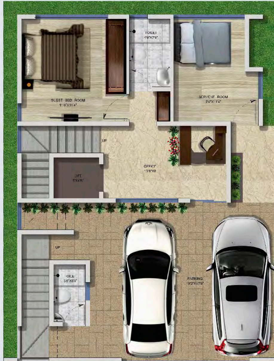
Ground Floor: 1015 Sqft (650 sqft – Personal Office, 2 Car Parking - 365 sqft)