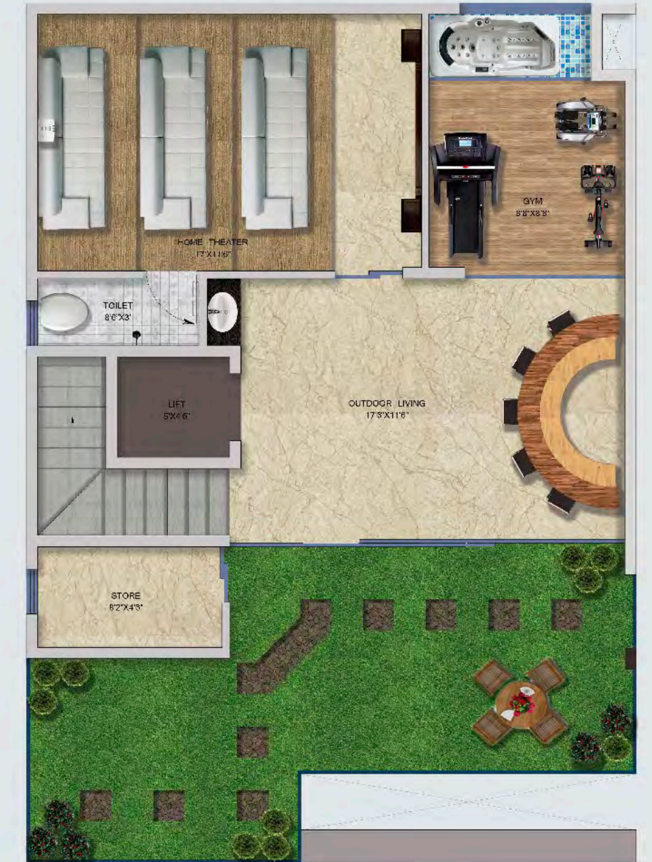
Third Floor : 1030 Sqft (House 700 Sqft & 330 Sqft of Terrace Garden)